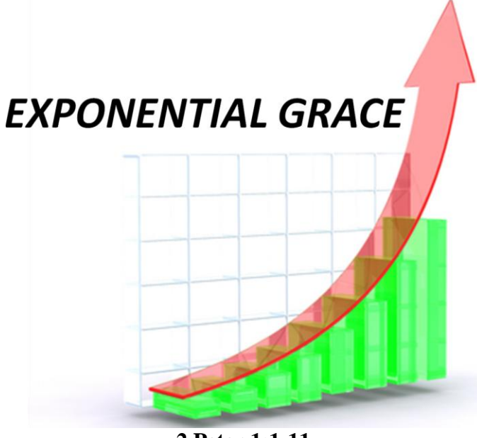
2 Peter 1:1-11

Simeon Peter, a servant and apostle of Jesus Christ,