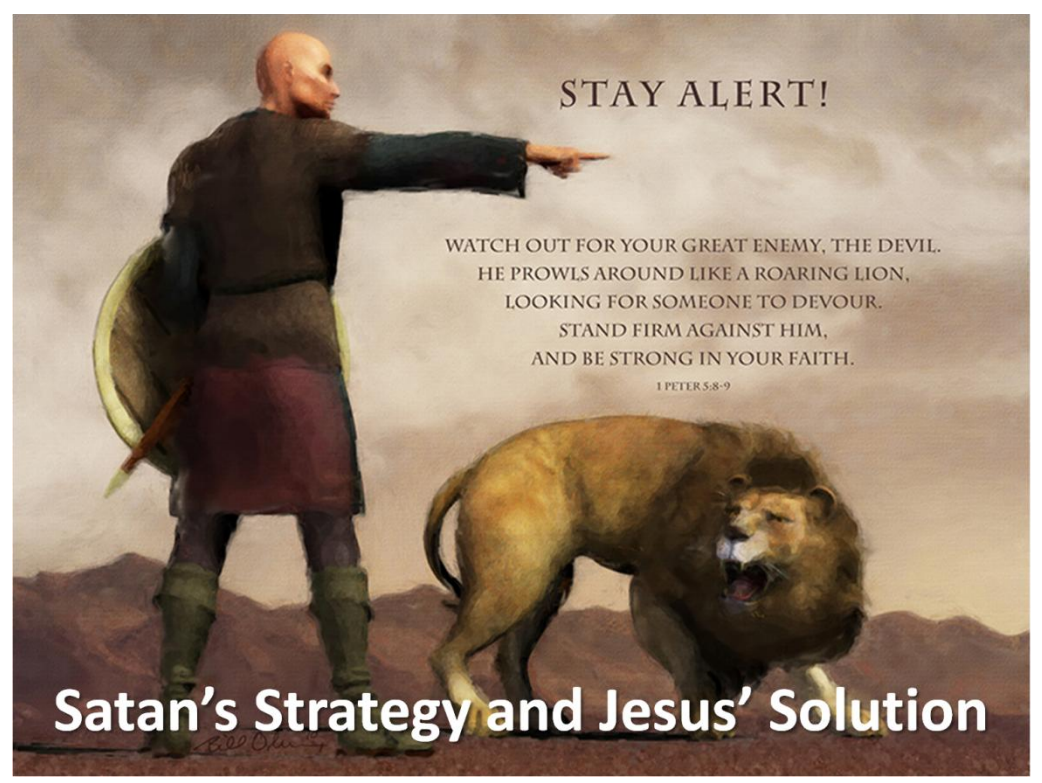
2 Peter 2:10-22

Bold and willful, they do not tremble as they blaspheme the glorious ones, 11 whereas angels, though greater in might and power, do not pronounce a blasphemous judgment against them before the Lord. 12 But these, like irrational animals, creatures of instinct, born to be caught and destroyed, blaspheming about matters of which they are ignorant, will also be destroyed in their destruction, 13 suffering wrong as the wage for their wrongdoing. They count it pleasure to revel in the daytime. They are blots and blemishes, reveling in their deceptions, while they feast with you. 14 They have eyes full of adultery, insatiable for sin. They entice unsteady souls. They have hearts trained in greed. Accursed children! 15 Forsaking the right way, they have gone astray.